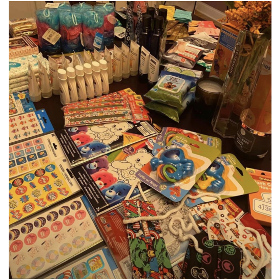
Contents of Community Care Packages

communities in Chicago for Easter. The packages included blankets, teddy bears, pencils and children masks. More than 200 care packages were distributed.